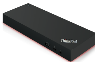
ThinkPad® Thunderbolt 3 Workstation Dock Gen 2