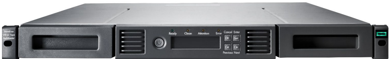
HPE StoreEver MSL 1/8 Tape Autoloader

Quickly and simply manage the tape media both in and out of the library with the standard bar code reader, configurable mail slots, and removable magazines. If a tape were lost or stolen, protect important business data from unauthorized access with data encryption options. MSL investment protection and uncertain data growth are easily managed within the MSL library portfolio. Quickly increase capacity and/or performance with tool-free drive upgrades in the MSL 1/8 Tape Autoloader or MSL2024 Tape Library, or move tape drive kits to the MSL3040 or MSL6480 for library scalability and additional enterprise class features. Proactively receive detailed information about your MSL Tape Automation with HPE StoreEver TapeAssure Advanced, a licensed feature of CVTL. Information about the library, drives, and media are all monitored for utilization, operational performance, and life and health information. Prevent problems before they occur by proactively receiving notification if any library, drive or tape media parameters fall below Hewlett Packard Enterprise recommended standards.