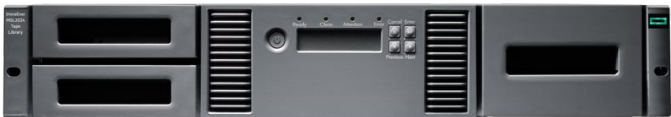
HPE StoreEver MSL2024 Tape Library