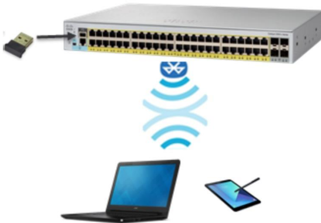
Figure 4. Over-the-air switch access using Bluetooth