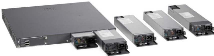
Figure 2. Cisco Catalyst 2960-XR Series power supply

Table 1 shows the different power supplies available in the 2960-XR Series switches and the available PoE power. Table 2 lists the PoE and PoE+ power capacity for the Cisco Catalyst 2960-X and 2960-XR Series. Table 3 gives the available PoE and switch power for the 2960-XR Series with different power supply combinations.