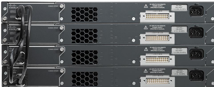
Figure 5. Cisco FlexStack-Plus switch stack

Cisco FlexStack-Extended enables a long-distance out-of-the wiring-closet stack option (floor to floor). It allows back-panel stacking of up to eight Cisco Catalyst 2960-X or 2960-XR Series Switches. FlexStack-Extended can be added to a Cisco Catalyst 2960-X or 2960-XR Series Switch with a back-panel stacking slot. Table 8 lists the switch combinations supported with FlexStack-Extended, and Table 9 lists the scalability and performance with the various software images. FlexStack-Extended is supported in Cisco IOS 15.2(6)E or later and is available in two module configurations: a fiber module and a hybrid module.