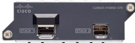
Figure 7. Cisco FlexStack-Extended: Fiber module