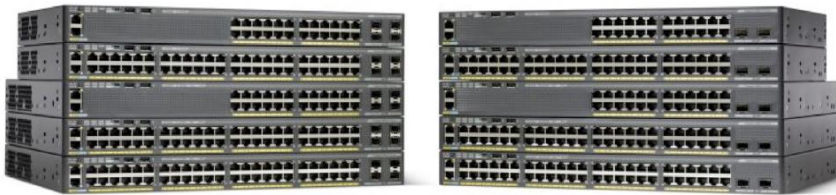
Figure 1. Cisco Catalyst 2960-X Series Switches

Cisco® Catalyst® 2960-X and 2960-XR Series Switches are fixed-configuration, stackable Gigabit Ethernet switches that provide enterprise-class access for campus and branch applications (Figure 1). They operate on Cisco IOS® Software and support simple device management as well as network management. The Cisco Catalyst 2960-X and 2960-XR Series provide easy device onboarding, configuration, monitoring, and troubleshooting. These fully managed switches can provide advanced Layer 2 and Layer 3 features as well as optional Power over Ethernet Plus (PoE+) power. Designed for operational simplicity to lower total cost of ownership, they enable scalable, secure, and energy-efficient business operations with intelligent services. The switches deliver enhanced application visibility, network reliability, and network resiliency.