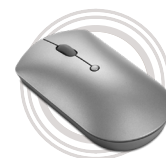
Lenovo 600 Bluetooth® Silent Mouse