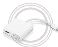
Lenovo USB-C 3-in-1 Hub