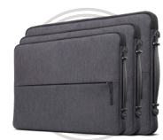
Lenovo Urban Sleeve Case 13"