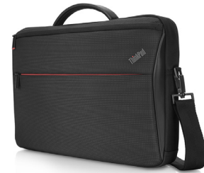
ThinkPad 14-inch Professional Slim Topload