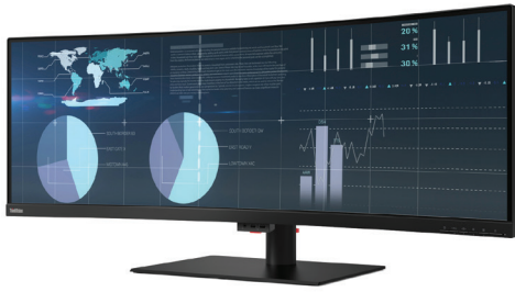
ThinkVision® P44w Monitor