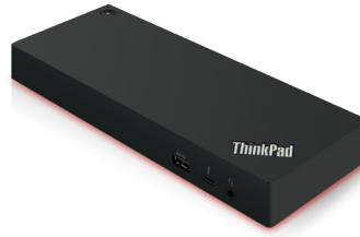
ThinkPad® Thunderbolt 3 Workstation Dock Gen 2