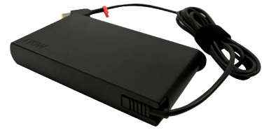
New Slim ThinkPad 230W AC Adapter