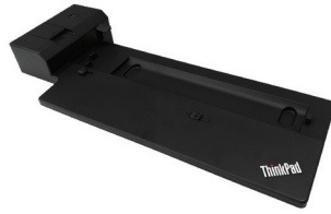
ThinkPad® Pro Docking Station