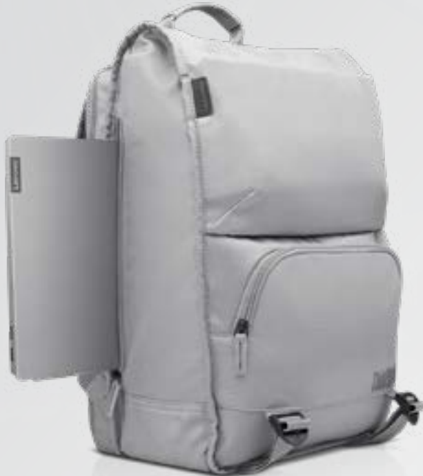
THINKBOOK URBAN BACKPACK 4X40V26080

A multi-functional backpack with anti-theft pocket ensures security on the move. The padded PC compartment offers cushioned comfort, while the high-quality fabric and stylish PU leather accent add to the contemporary design.