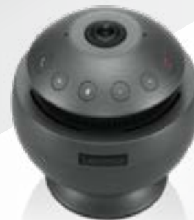
LENOVO VoIP 360 CAMERA SPEAKER 40AT360CWW

Built for on-the-go video conferencing, this 360° video camera. It is optimized for Unified Communication Platforms like Skype for Business, Skype, Amazon Chime, Cisco Webex, Cisco Jabber, Google Hangouts, Zoom, Bluejeans, and more. It allows split-view, multi-video conferencing using a button, plus a dedicated switch to turn off the camera for privacy. Acoustic echo cancellation including background noise suspension ensure conference calls are effective.